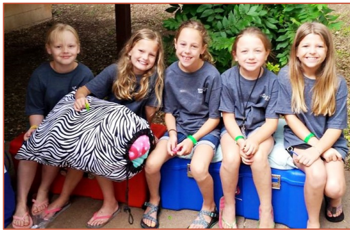
Buffalo Gap Presbyterian Encampment