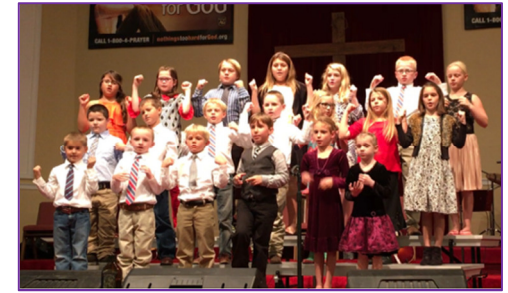
Kids' Music Club