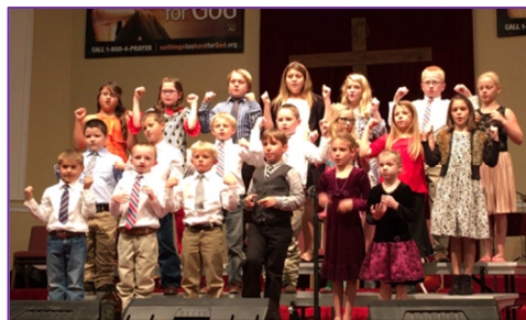
Kids' Music Club

We participate in the sacraments of baptism and communion regularly. We also provide daily and seasonal devotional materials to our members for added personal growth at home.